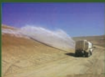
Slope Stabilization / Erosion Control

acrylic copolymer that is not only effective for stabilizing fugitive dust and erosion; it also effective for lowering job cost and reducing water consumption.