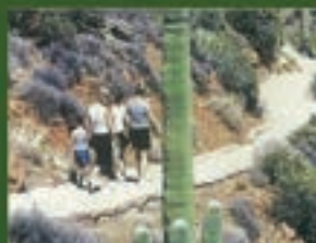
Trails and Paths