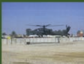
Airfields and Helicopter Pads