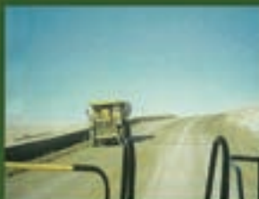
Heavy Haul Roads